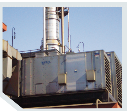
PURAFIL DEEP BED SCRUBBER AT TUPRAS IZMIT REFINERY IN TURKEY